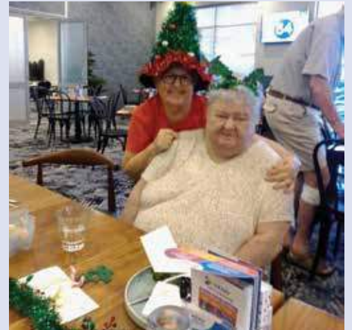
Queensland Townsville Christmas Party