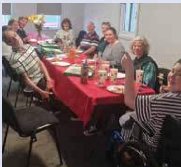
Tasmania North West and South Support groups