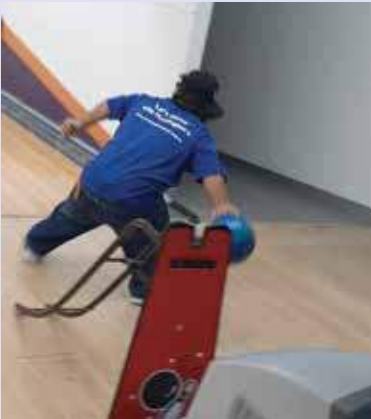
South Australia Coffee & Co